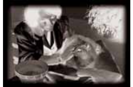
2} CALM YOUR CAT.